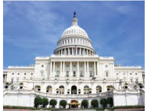
"Poor Management of Security Badges Leaves Federal Buildings Vulnerable to Shooters, and Terrorist Attacks" -- United States Inspector General Report 2016

The solution improves security, removes the threat from lost, stolen, shared, and cloned cards. The 2 factor authentication feature protects and extends the life of your current access control solution.